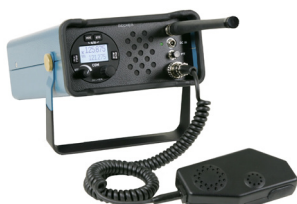
GK615 & GK616