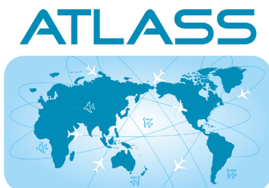
ADS-B TRAFFIC LOCALIZATION & SURVEILLANCE SYSTEM